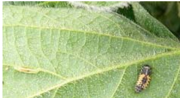
Syrphid Fly Larvae Lady Bug Larvae Soybean aphid predators